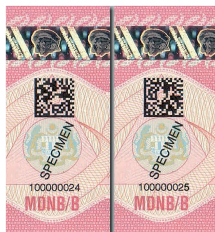
typical application (tax stamps)